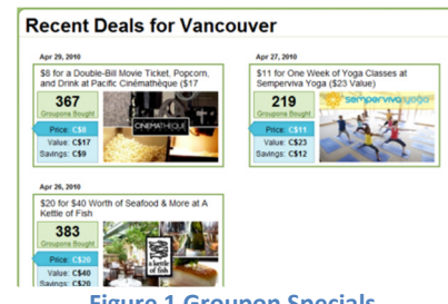
Figure 1 Groupon Specials

Groupon, http://www.groupon.com/ , is a web site dedicated to finding 'deals' in your city and, yes, Vancouver is included. It's simple to use just sign up for the newsletter by entering your email address and choose your city. That's it, every day you'll get notification of a new special!